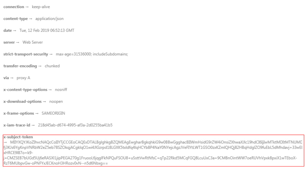
Figure 3-1 Header fields of the response to the request for obtaining a user token

x-xss-protection \rightarrow 1; mode=block;